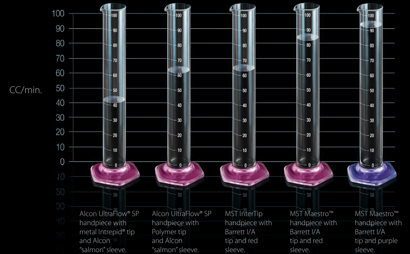
Irrigation Flow Comparison 1 At 75cm bottle height